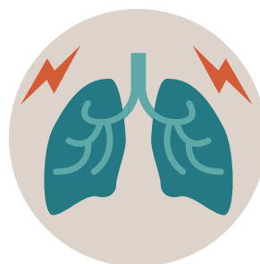
Shortness of Breath